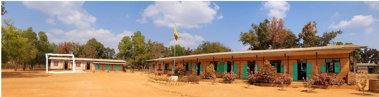
The school today with the additional room to be built

A school welcomes the 210 children of the village. It is of good quality but it lacks a crèche and a classroom for teenagers. One evening, we take part in a school committee meeting to study the estimate for the teen room, ask questions, request additional information and finalize the project. RDS Switzerland provides the necessary CHF 3,800. The new room will be ready for the next school year in June 2023.