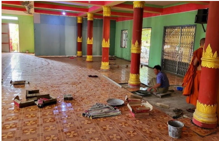
Layout of the future “classroom”»

became too cramped, it had to be enlarged. RDS Switzerland has financed part of the work so that these young people benefit from a correct framework to follow their courses.