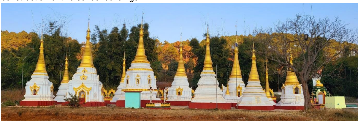
North of Kalaw

With great caution and discretion, we have expanded our micro-credit program in favor of peasant families, we have maintained our emergency food aid and we have started the construction of two school buildings.