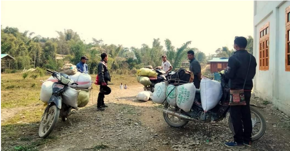
Food aid in the Sagaing region

Thanks to her contacts in Naga Land, in the northwest of Myanmar, Su also offers food aid to several needy families.